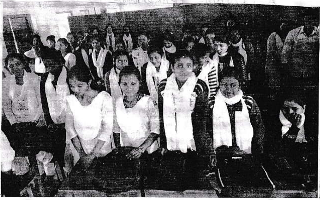
Students of the school participating in the cultural program.