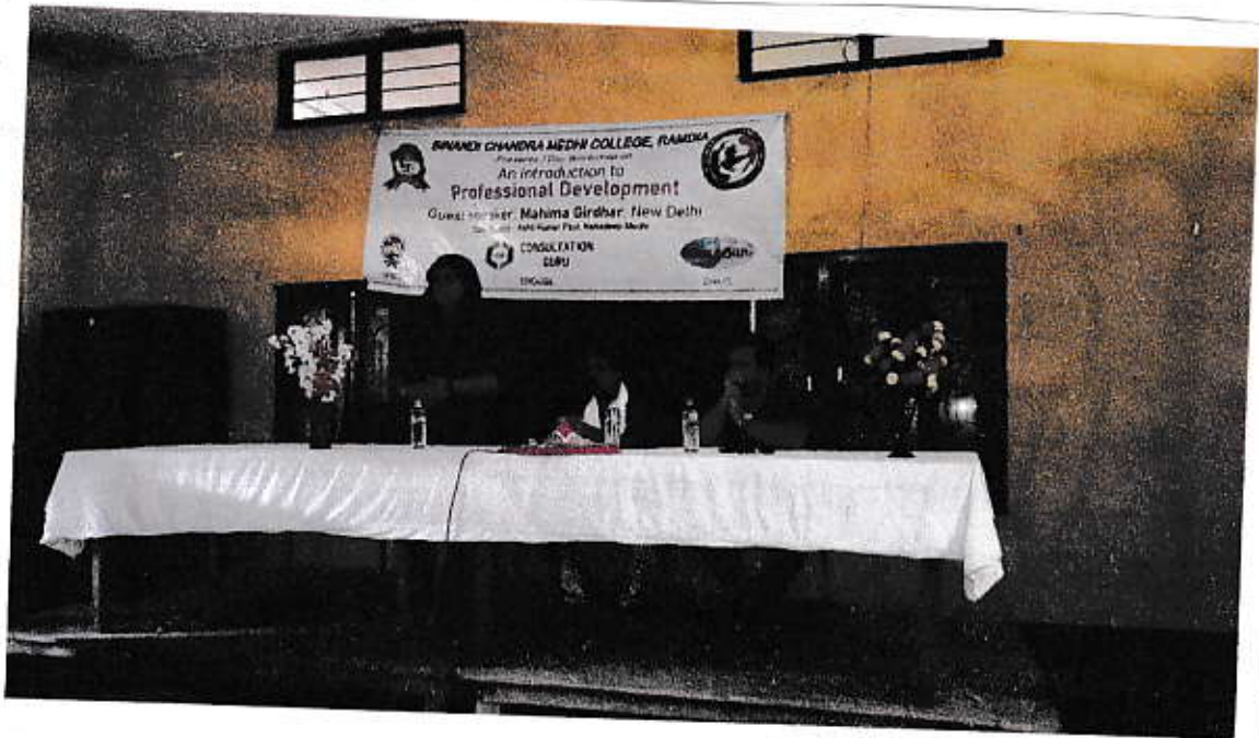
One Day Workshop on Professional Development